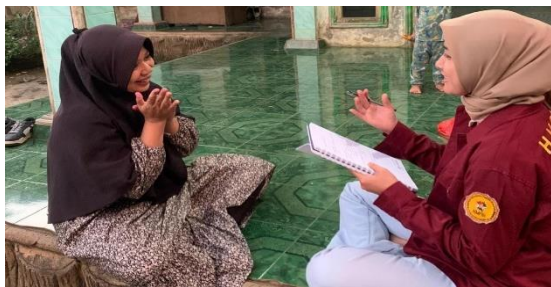
Figure 2. Interview With Gen Millennial

These interview result show that the use of language mixture is not only in influenced by linguistic factors but also by social and cultural factors. Respondent realized the importance of adapting language to the context and audience. Thus, they are able to adapt and communicate more effectively in various situations.