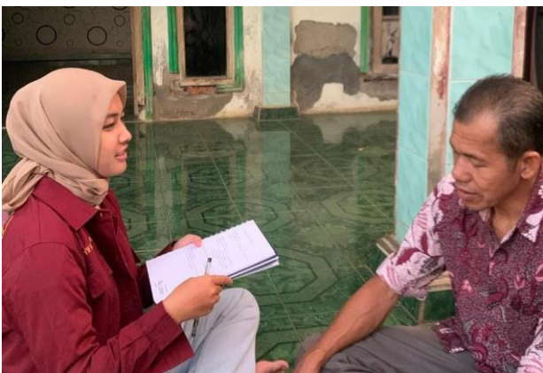
Figure 5. Interview With Gen Millennial

The result of the interplay between qualitative and quantitative methods used by the researcher provide a deeper understanding of the phenomenon of code-mixing and code-switching. From the qualitative result, it can be seen that many respondents believe that code-mixing improves the quality of communication. This is in line with the quantitative data, which shows that 54.50% of respondents often use a mixture of languages in their interaction. When interacting with older people, respondents tend to use formal and polite language, which reflects the values of politeness in the culture. These qualitative results are reinforced by the quantitative data, which shows that the majority of respondents feel comfortable communicating, indicating that they are able to adjust to different social contexts.